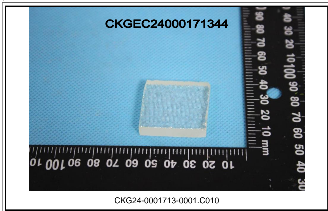
此照片仅限于随 SGS 正本报告使用 ***报告结束***